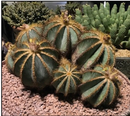
Parodia gigantea from the Tri-City Show.

Oh wow folks. I can't even tell you what going on this trip meant to me. It was a dream come true for this newbie, for sure. I discovered at the May meeting that there were still seats available for the LA trip so I literally ran to sign up, immediately. Hah! Then, I checked to see if I could take a day off work. It was an action-packed weekend and one I won't soon forget. There was just so much to see, and oh, the opportunities to buy at the show and nurseries. Also, a bucket-list visit to the Huntington Gardens. Plus, it was