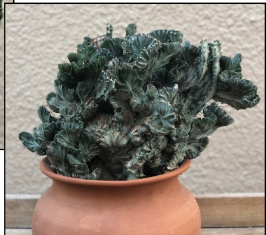
Above a grafted crested Euphorbia. Right a crested Euphorbia non-grafted.