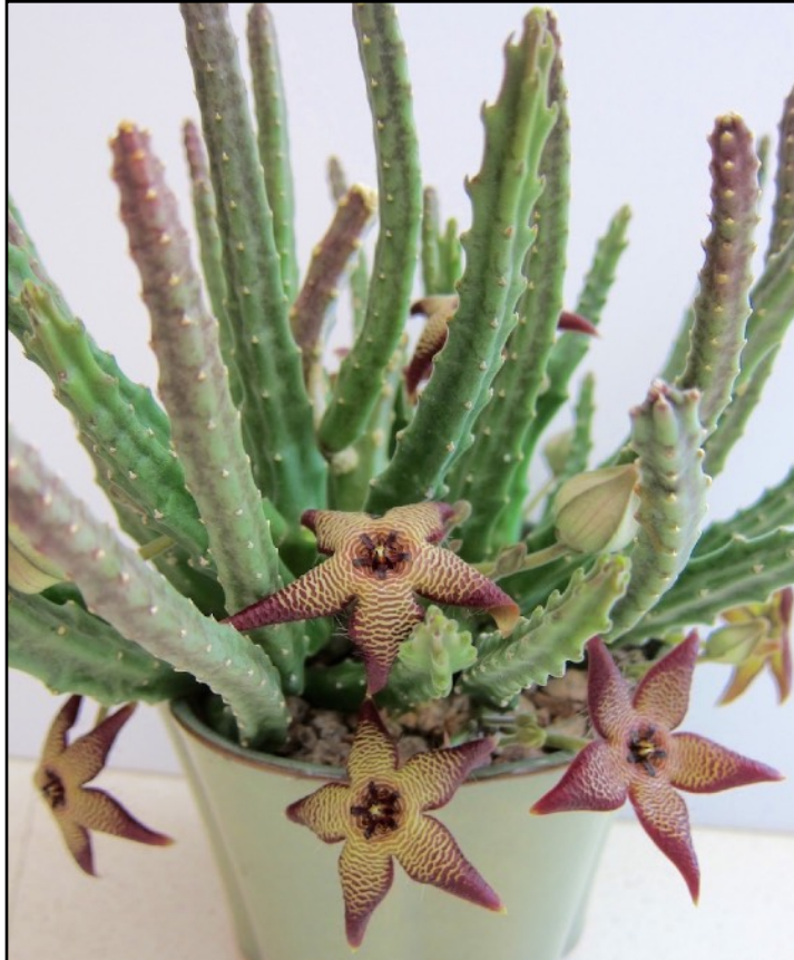
Stapelia kewbensis living happily without mealybugs.

Mealybugs gather to feast and reproduce. When discovered, immediately put your plant in isolation. The plants near the one you discovered the mealybugs on are probably infected too. Mealybugs love to deposit eggs far and wide. Change the soil and throw it away, not in a compost heap—remember the eggs.