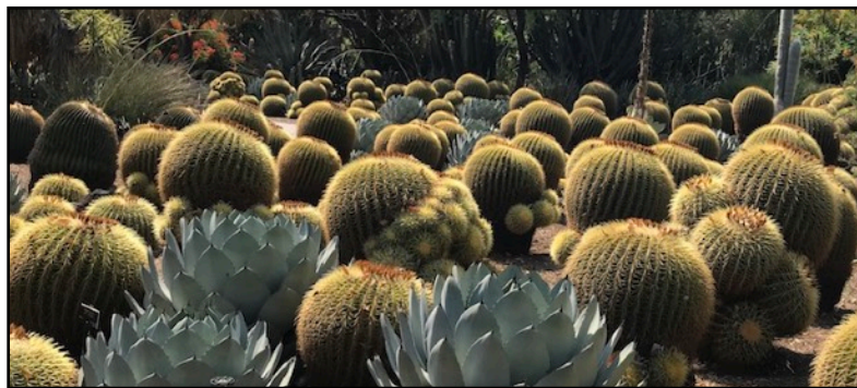
Beautiful cactus and succulent beds at the Huntington.

Next stop was the motel where we were given the choice of visiting the next nursery or opting out. Some of us did stay behind, while the rest went on to another private sale at California Specialties Cactus Ranch in Reseda. There was a huge selection of plants and all prices, I was told later. I opted to crash and chill in my room. Everyone was free to pursue dinner as they pleased, with various choices within walking distance, as well as Claim Jumper right next door.