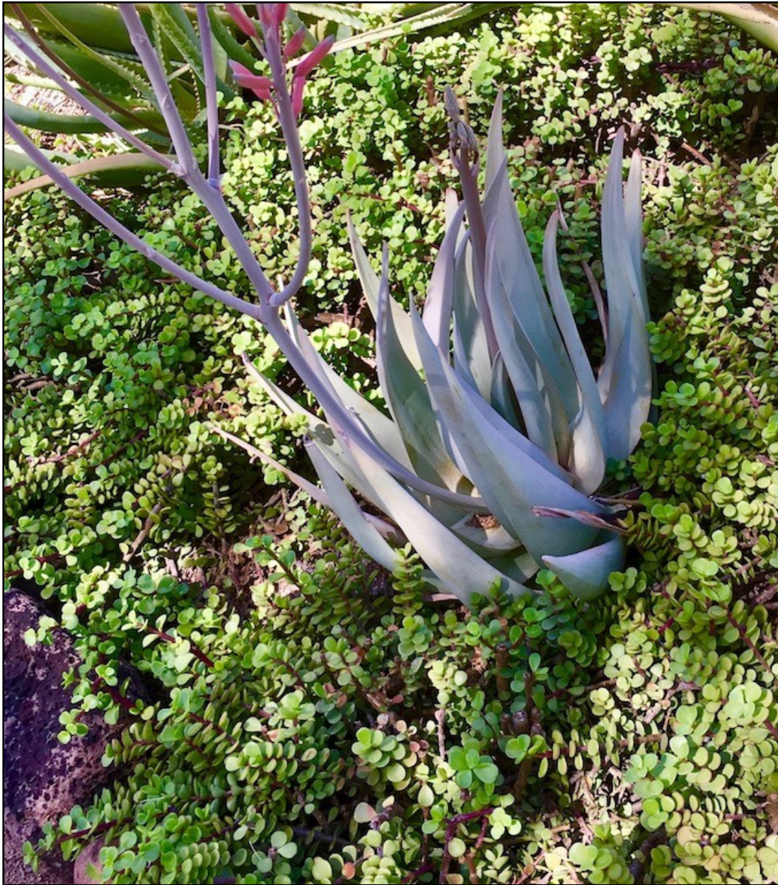
This pale blue-gray Aloe dhufarensis really 'pops' when showcased in a bright green bed of elephant food at the DBG.

Care: Portulacaria afra needs full sun until about 1 p.m. in the summer, and appreciates filtered shade through the rest of the day. Give it full sun all winter. The leaves wrinkle when dry, so provide a regular watering schedule: twice a week in the hot months, monthly in the cool months. Easy to propagate, just break off a stem, allow to dry for a few days and stick in some dirt.