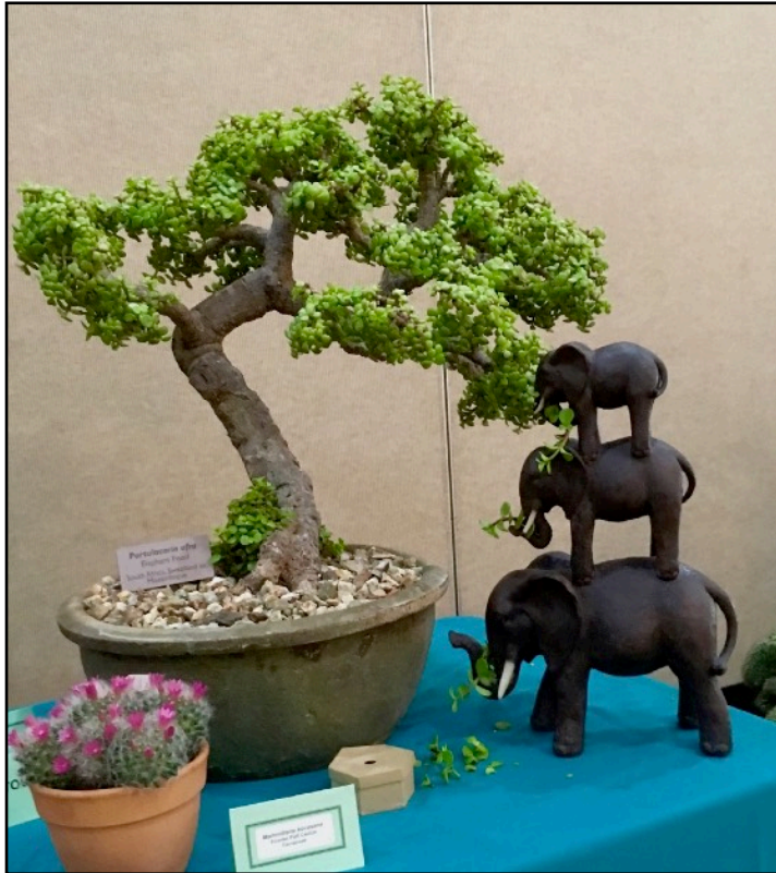
Perhaps the whimsical miniature elephants browsing on the elephant food influenced the vote just a bit.

Elephant food ( Portulacaria afra ) is the Rodney Dangerfield of the succulent world. It gets no respect. Succulent hobbyists and horticulturists often look down their noses at the humble elephant food because it is so common and effortless to grow. So, it was nice to see this species get some recognition for a change.