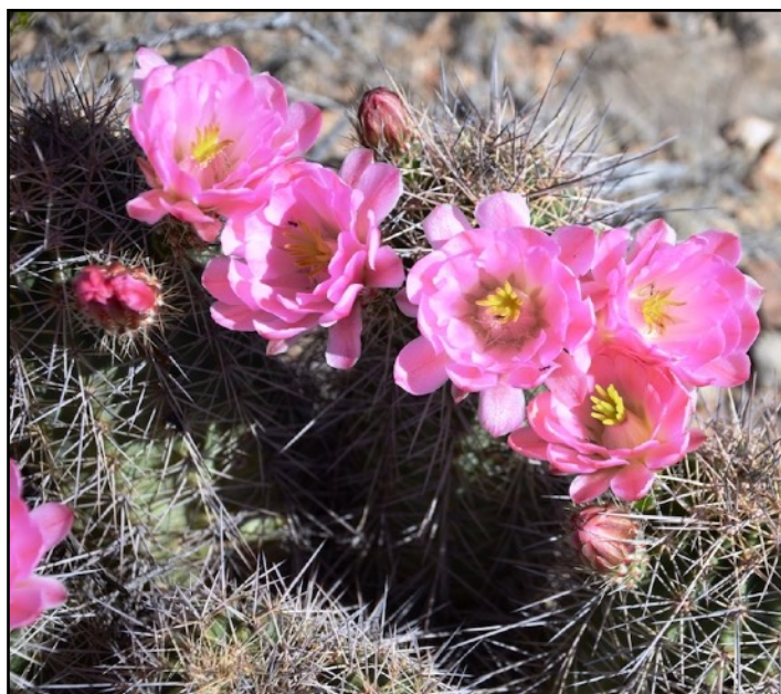
Echinocereus x roetteri

Needless to say, I enjoy, with an immense passion, seeing and photographing our native cacti grow, flower and thrive in their natural habitats. My presentation will take you to two vastly different places that are near and dear to my heart. The first half takes us to a place that is about 40 miles slightly northeast from my home town of Las Cruces, NM, and across the Organ Mountains and White Sands Missile Range. In the immediate vicinity of Orogrande, NM (Otero County), is a small mountain range that lies in the northern portion of the Chihuahuan